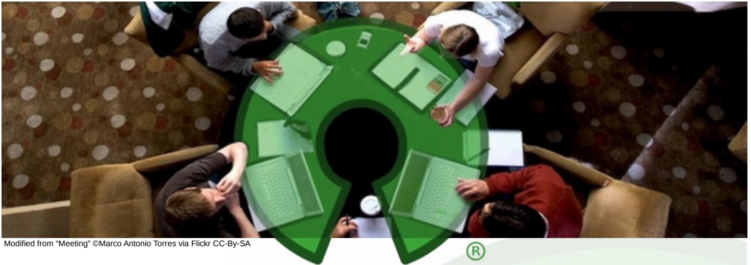
Modified from "Meeting"

In the 1990's the Open Source Initiative began a campaign, inviting individual hackers to join the open source movement . Ten years ago the OSI championed open source principles and practices , responding to FUD while promoting open source development, projects and communities. This year, throughout 2015 , in what has been called the " Golden Era of Open Source ," the OSI expanded our reach and broadened our message engaging beyond the software industry and across the IT sectors of education, government, health care, manufacturing—after all every company is a software company—realizing indeed, " 2015 was the year open source software took over the IT world. "